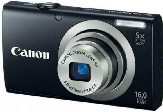
Canon power shot A2300