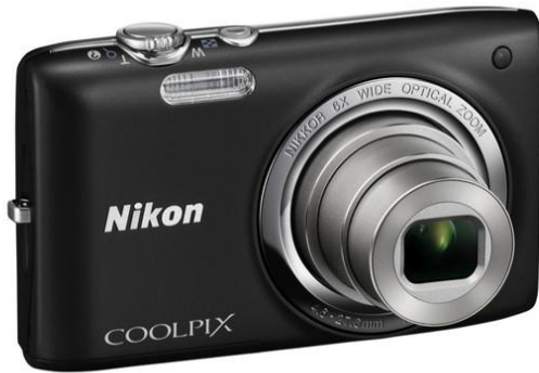
Nikon coolpix s2700